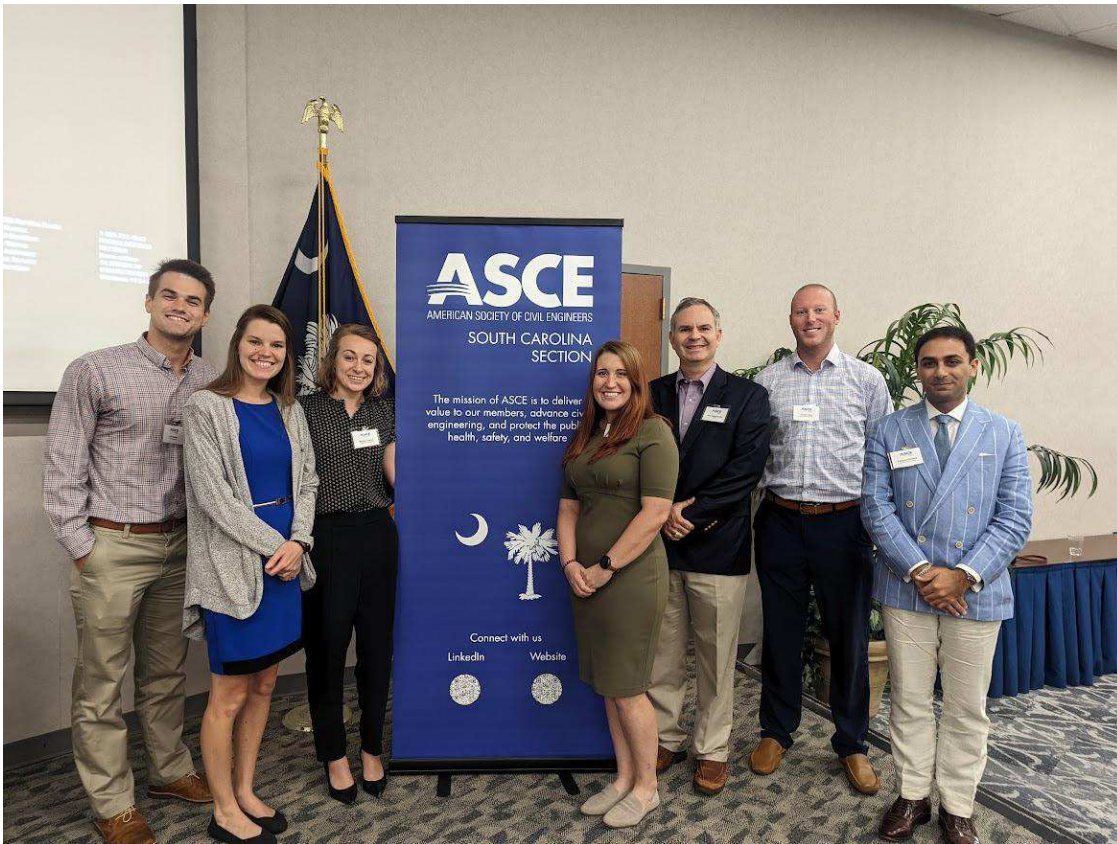
ASCE Midlands Branch at the SC Section Conference in August 2022

It was great to see many of you at the ASCE Conference in August. Congrats and thanks to our colleagues at SC Section for putting on a successful event. Here's to more of these in the future. See below for photo of a few of the Midlands Branch Board members who attended.