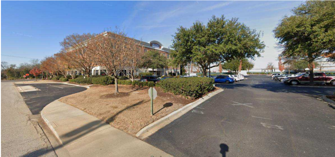
Google Maps Street view of Michael Baker Intl. office from Devine Street