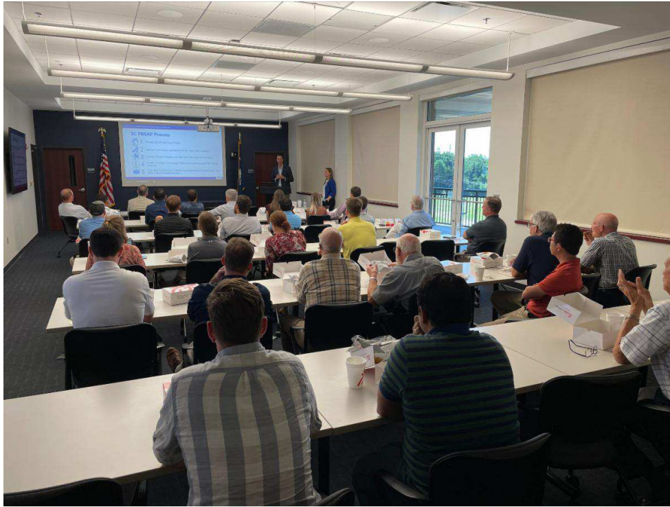
Photo from our September 21, 2022 meeting in Michael Baker's Conference Room

Coming up on October 19, we will be hearing from a group that to the Board's knowledge, has not previously presented to our Branch. Thank you to our presenter and sponsor Marino Engineering Associates. We don't have many coal mines around our parts, but it should still be very interesting.